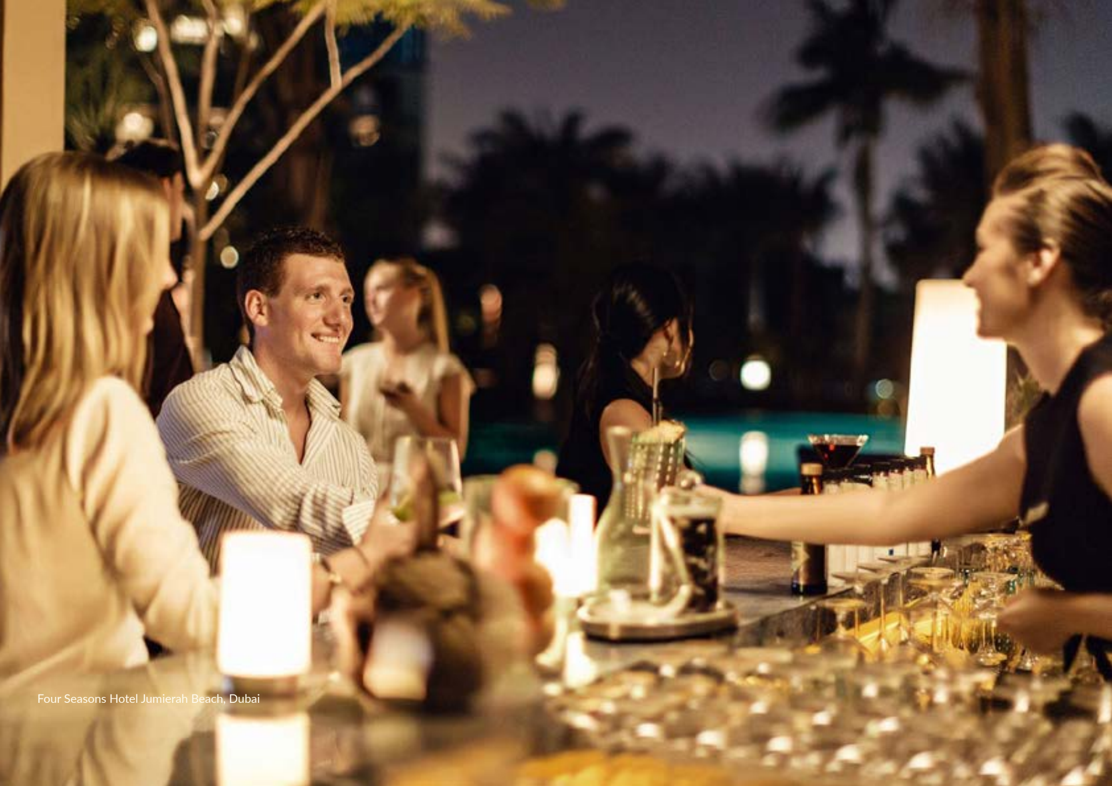
Four Seasons Hotel Jumerah Beach, Dubai