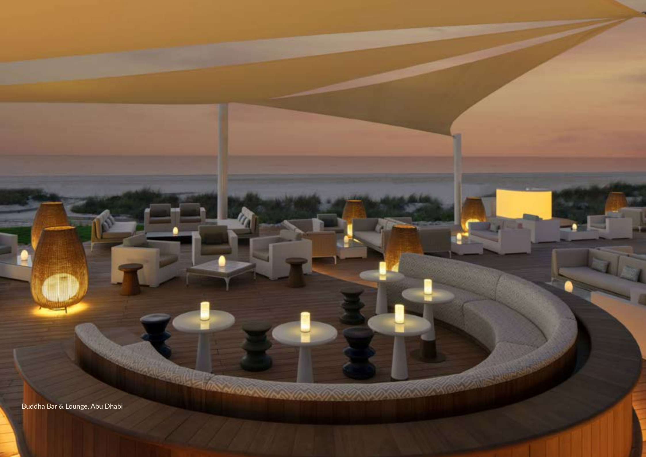
Buddha Bar & Lounge, Abu Dhabi