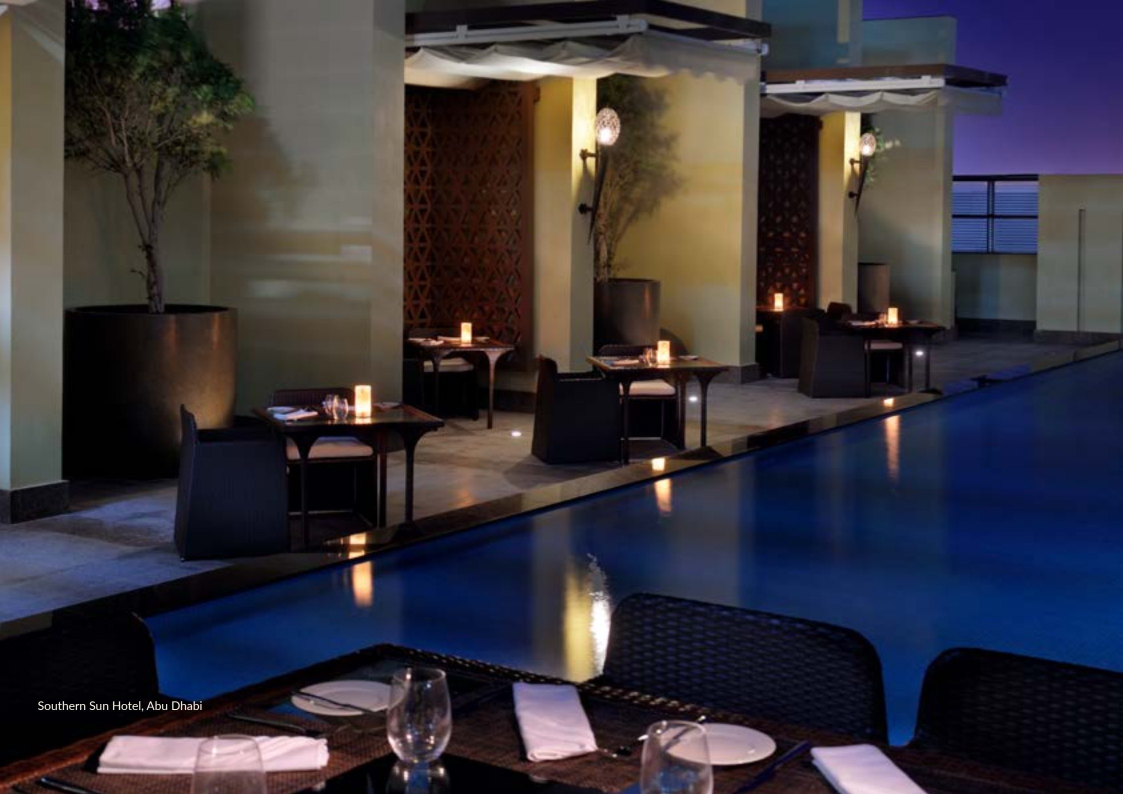
Southern Sun Hotel, Abu Dhabi