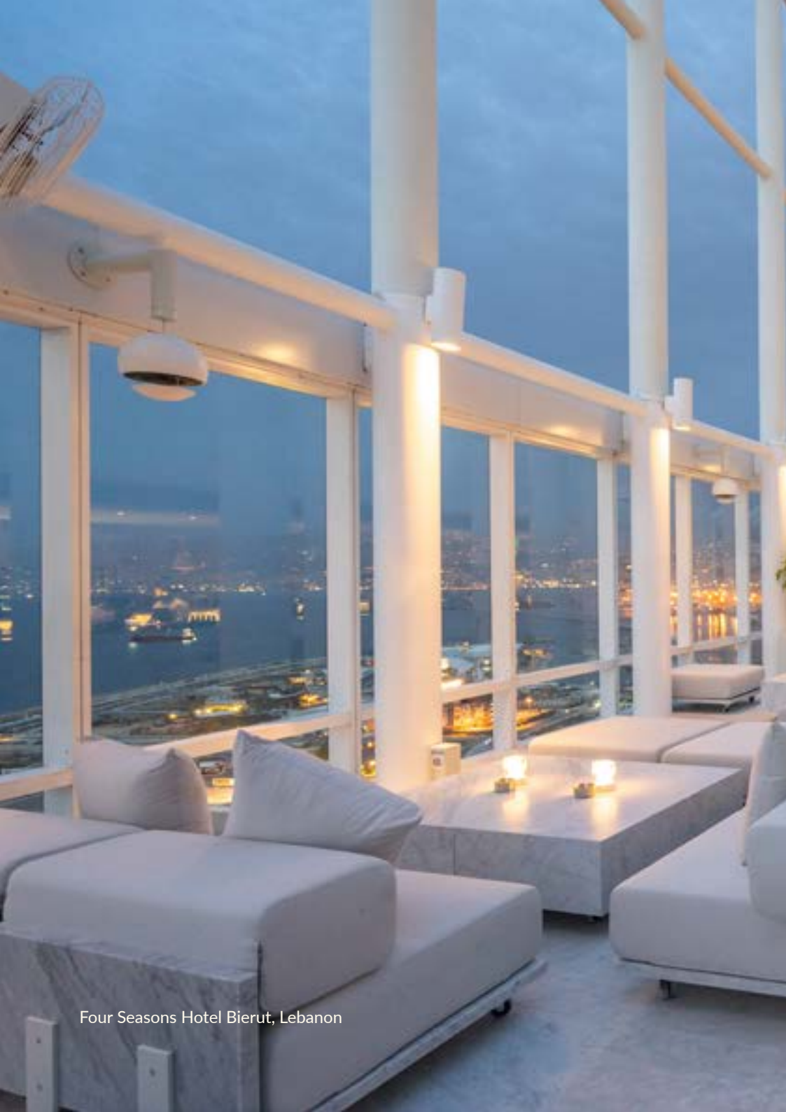
Four Seasons Hotel Bierut, Lebanon