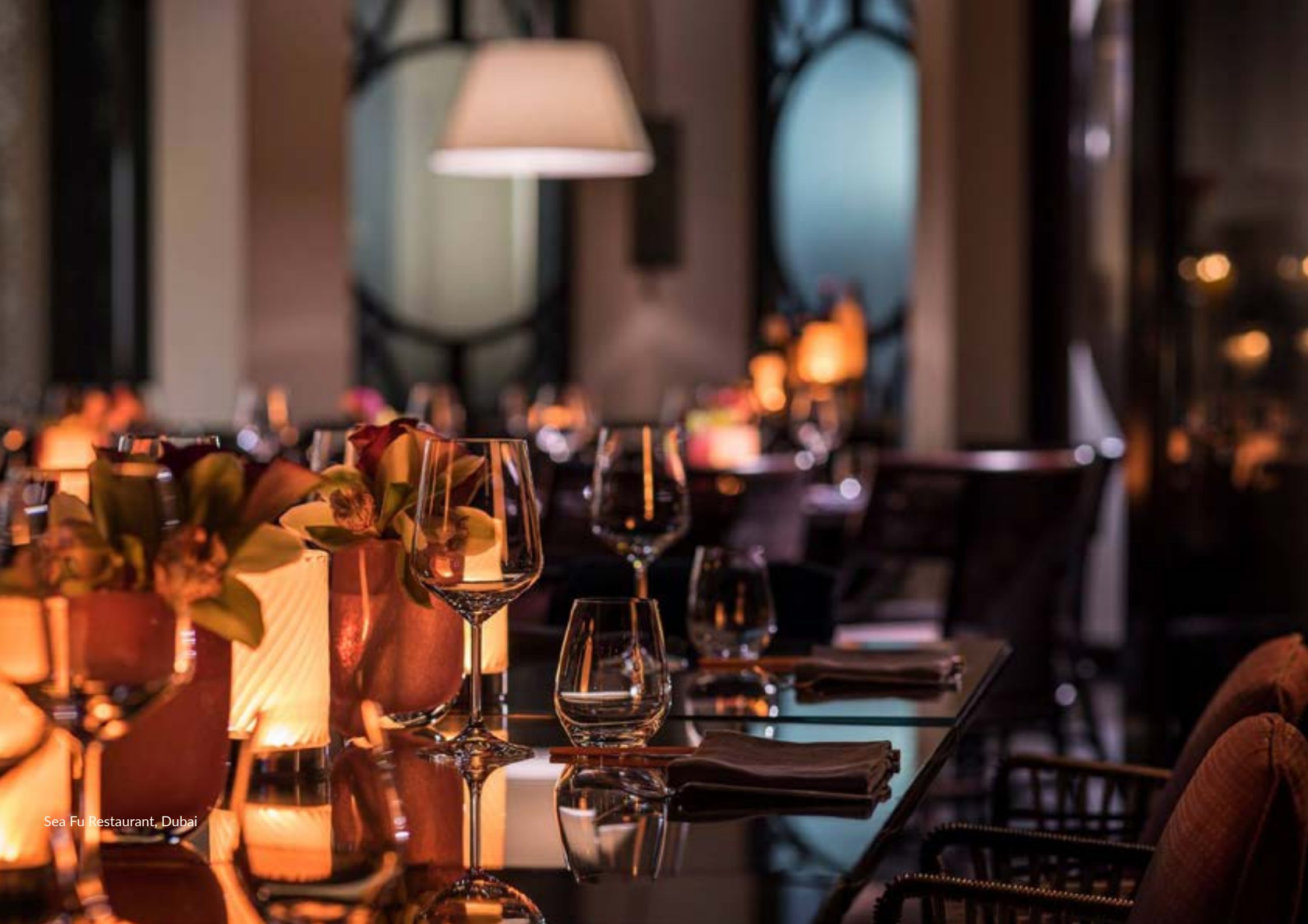
Sea Fu Restaurant, Dubai