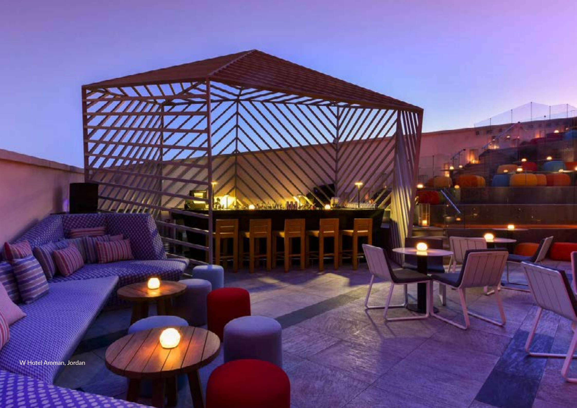
W Hotel Amman, Jordan