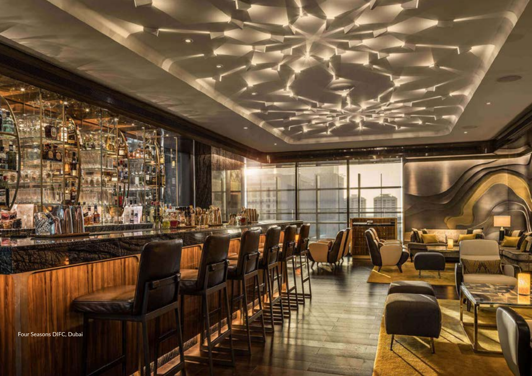
Four Seasons DIFC, Dubai