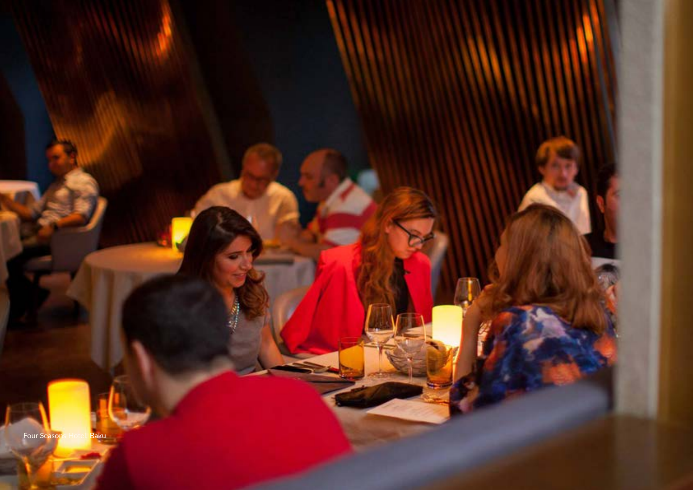
Four Seasons Hotel, Baku