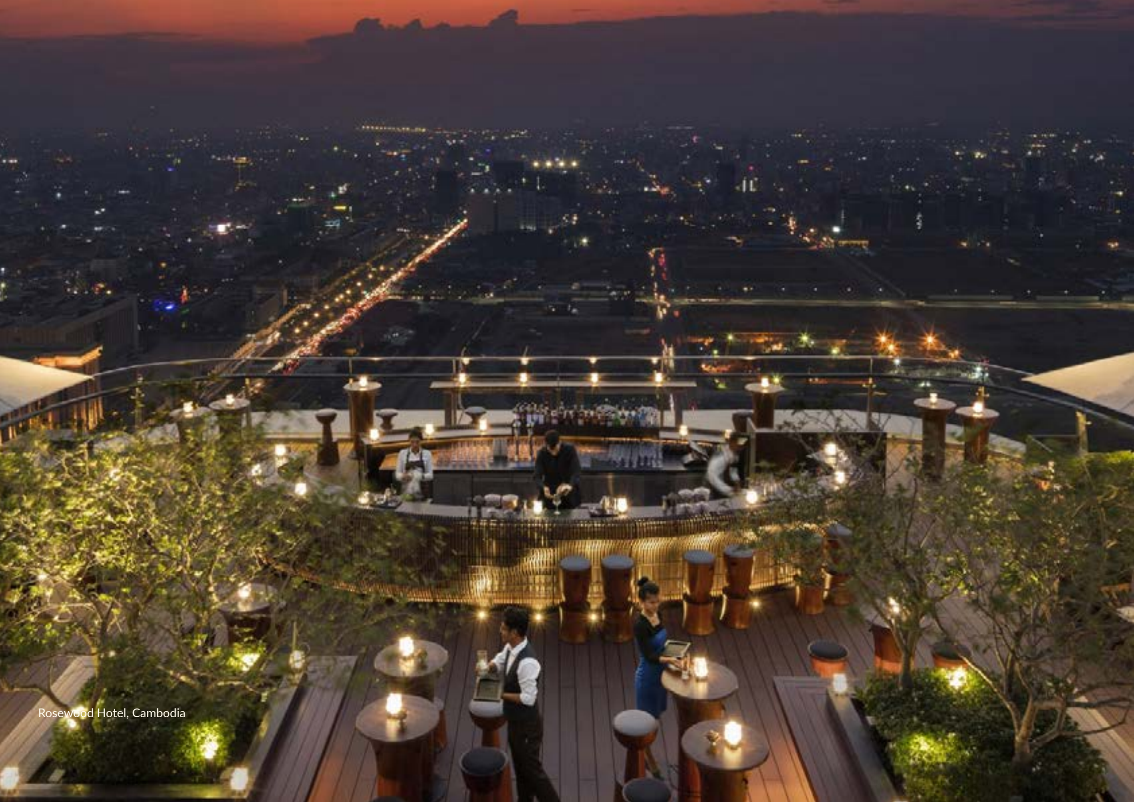
Rosewood Hotel, Cambodia