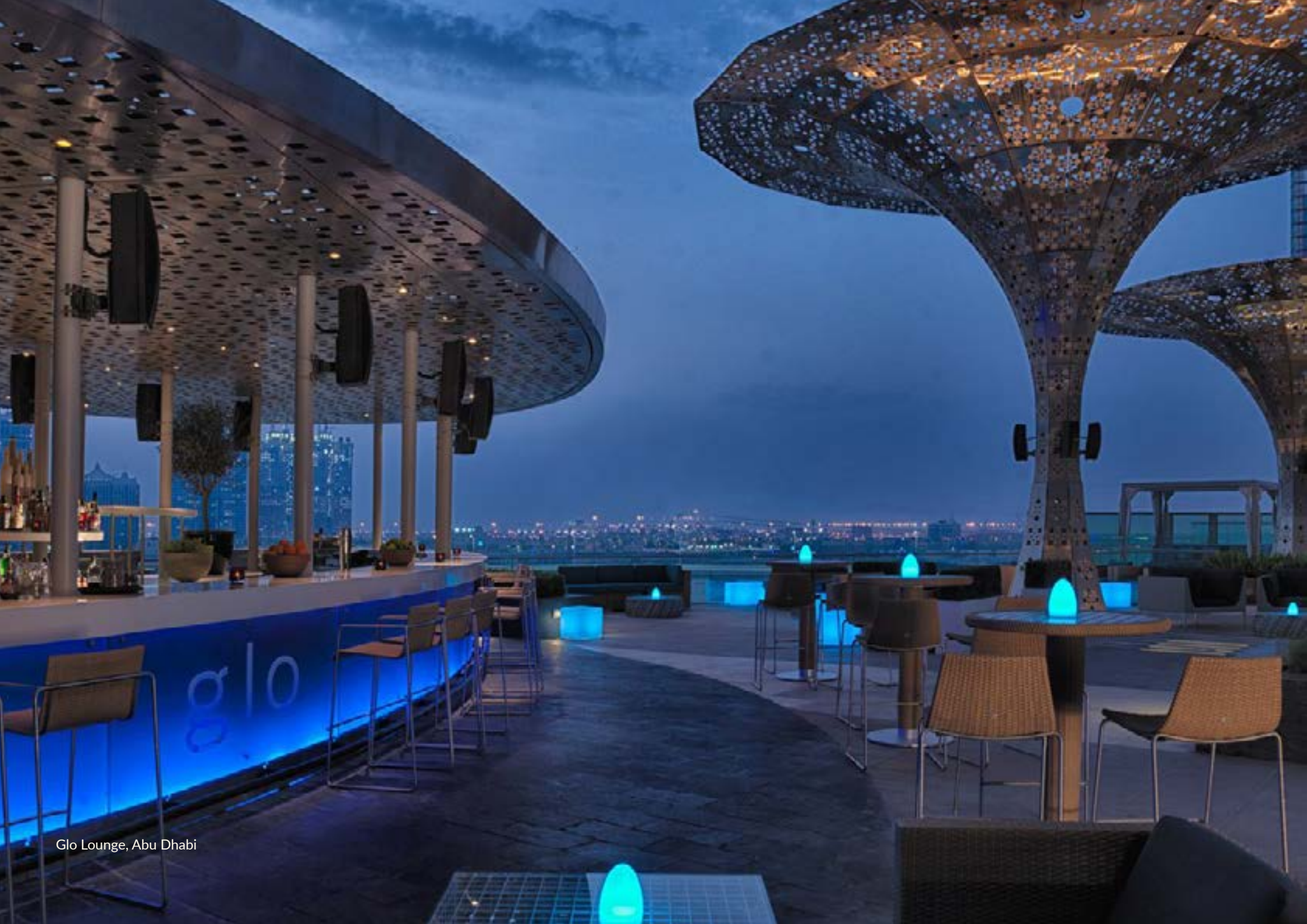
Glo Lounge, Abu Dhabi