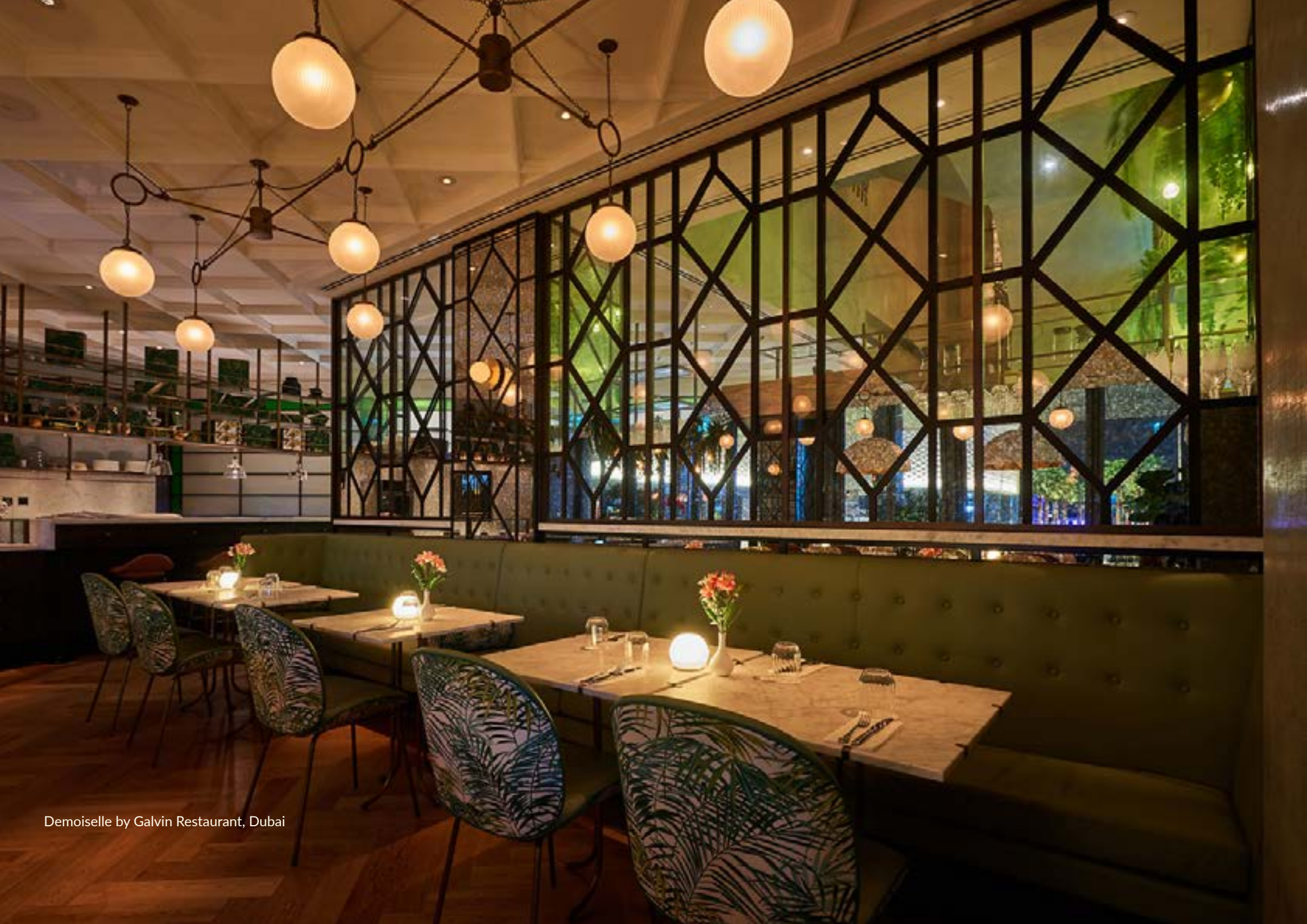
Demoiselle by Galvin Restaurant, Dubai