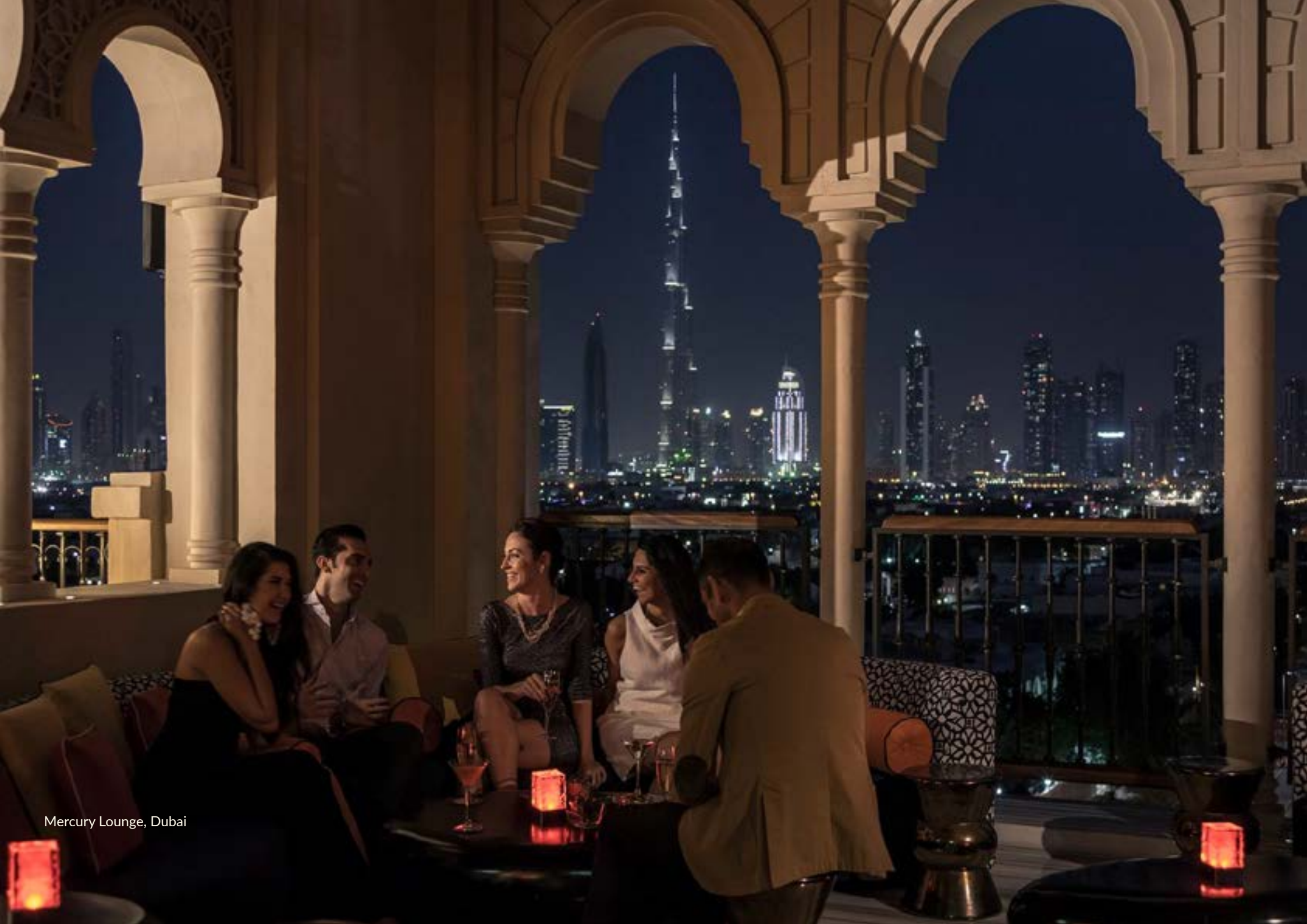
Mercury Lounge, Dubai