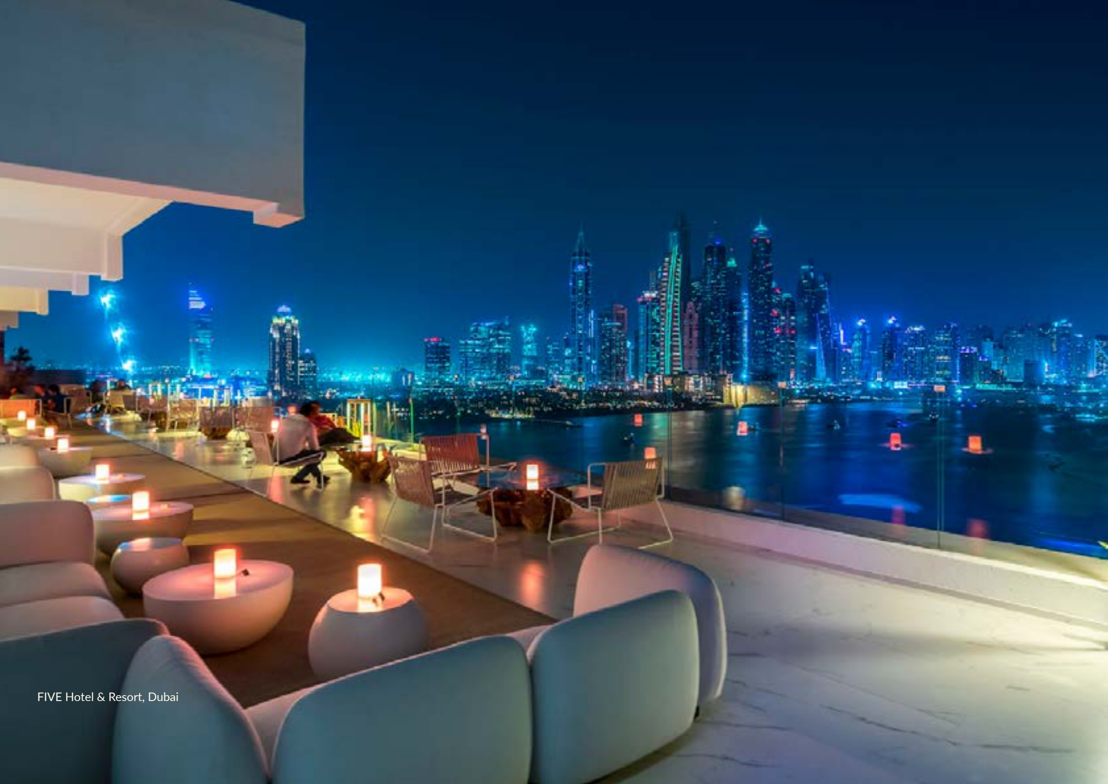
FIVE Hotel & Resort, Dubai