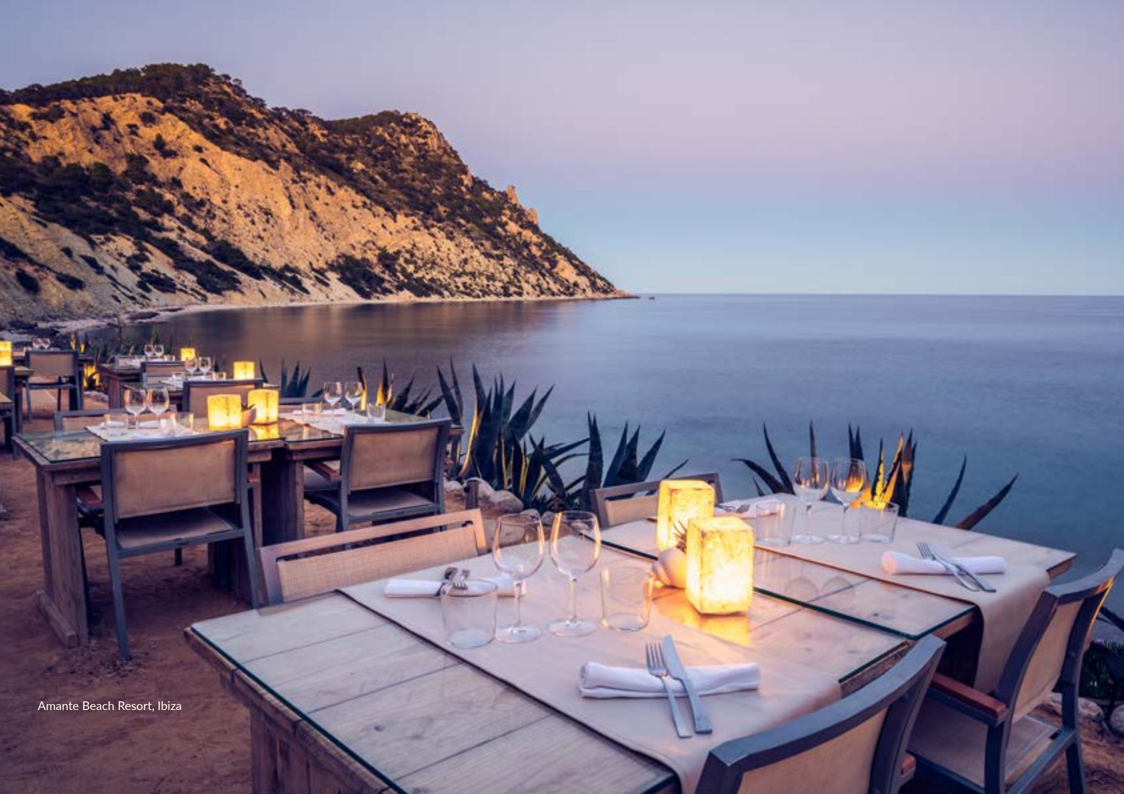
Amante Beach Resort, Ibiza